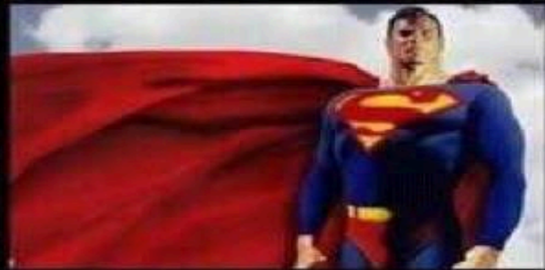
What kids think I do