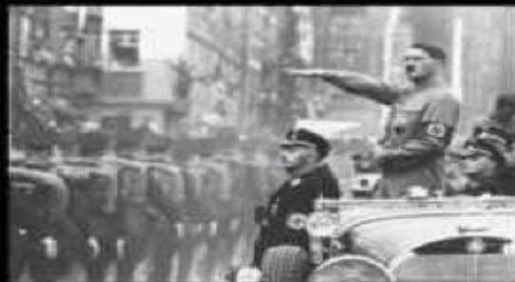
What grown-ups think I do