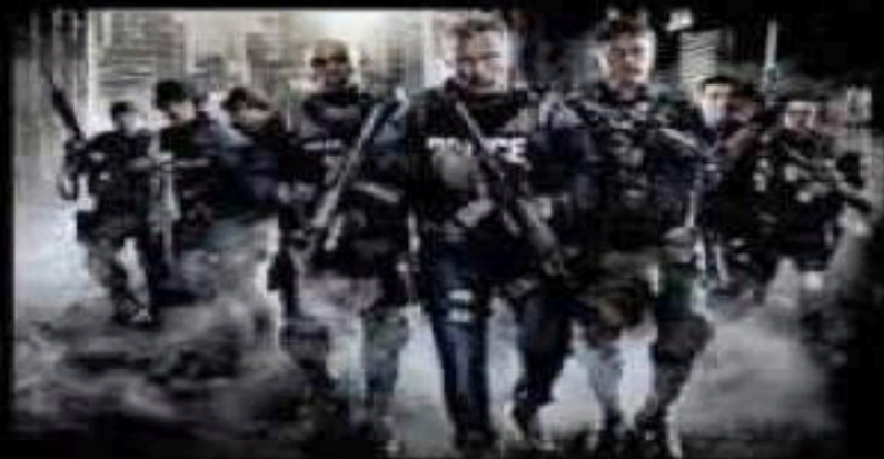
What my buddies think I do