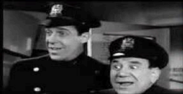
What my mom thinks I do